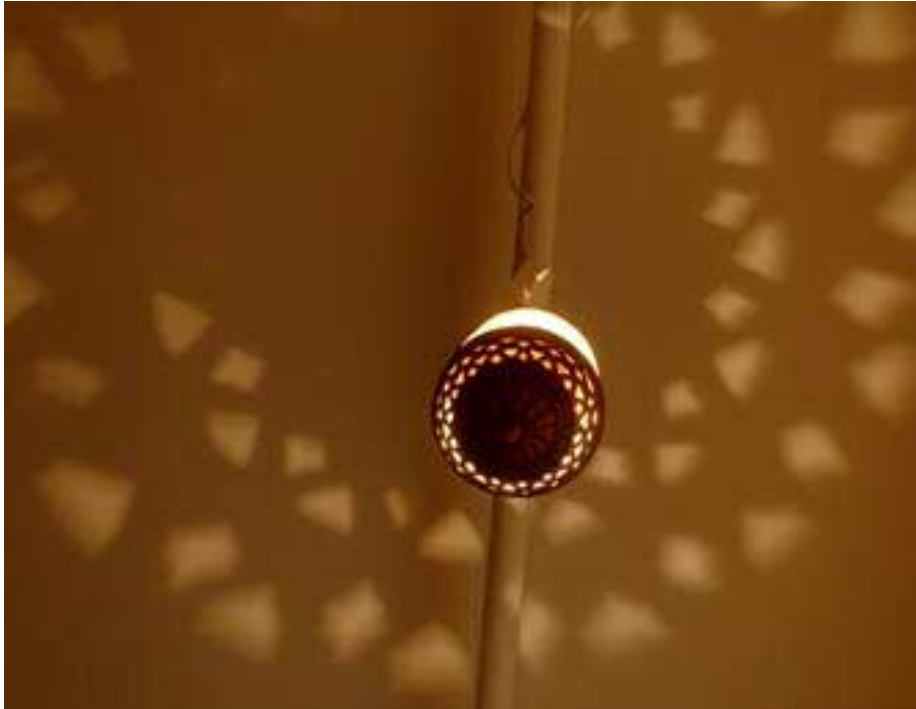
*Light reflection of pattern onto

The Lantern has been specifically designed to illuminate an specific area with a soft warm light and reflect a pattern onto surrounding walls and ceilings at the same time.