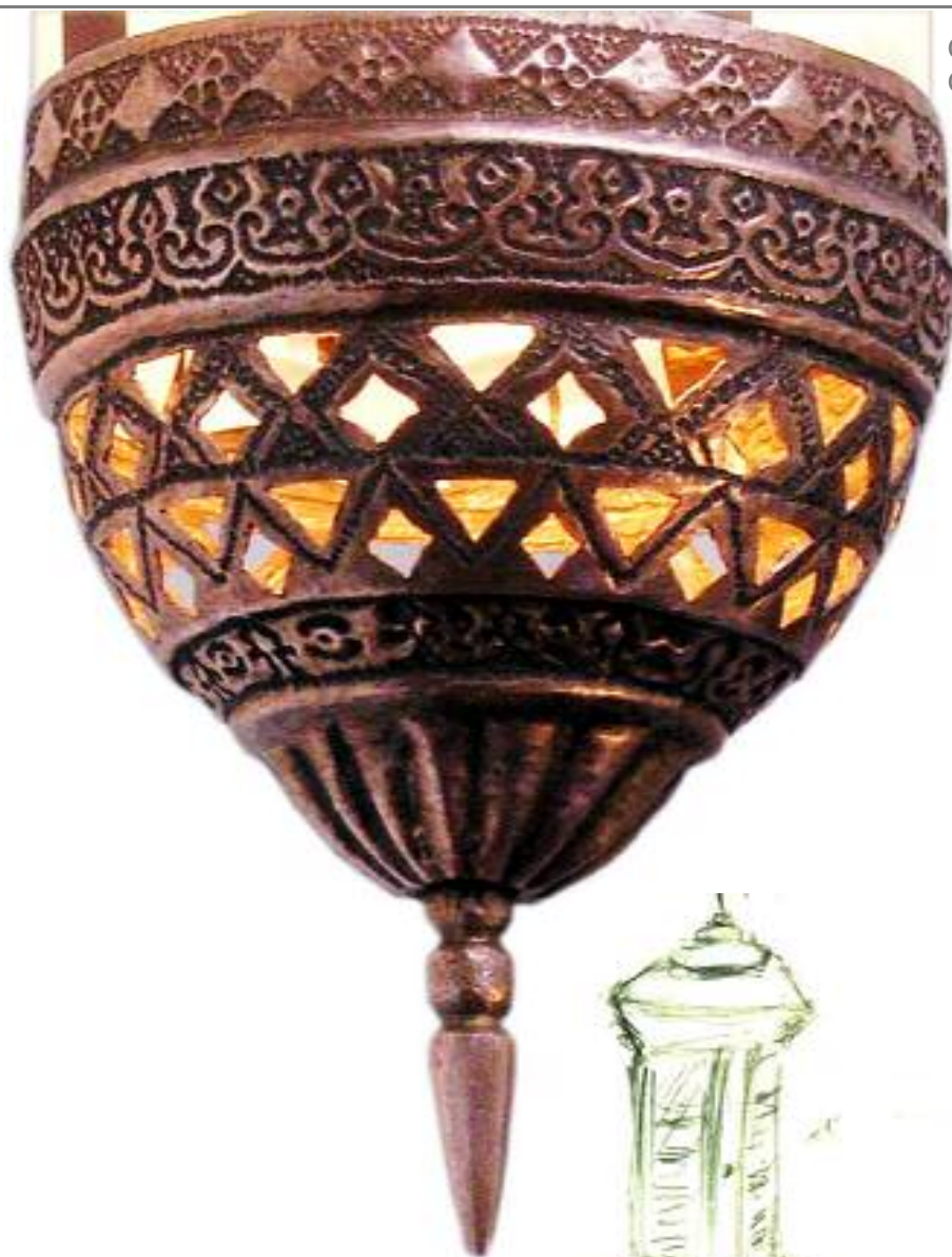
Close up Image of Omani Coppersmiths work