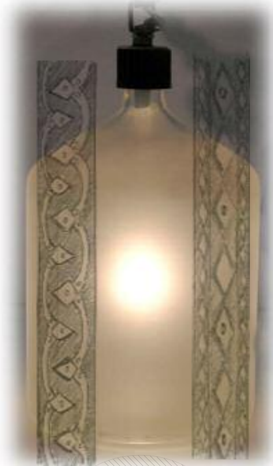
*Sand blasted Borosilicate g envelope with low voltage lan